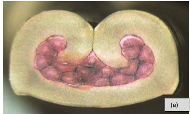
Cross Sections Showing Minimum (a) and Maximum (b) Area Index per Terminal Specification—a Variation of \pm 3.5\%

Therefore, varying the CW by 2% would result in a CH variation of 2%, or 0.0014 in. At a CH tolerance of \pm 0.002 in, 35% of the total CH tolerance would be used by a 2% variation in CW. Thus, the importance of crimp width control is obvious when tooling is changed during a production run.