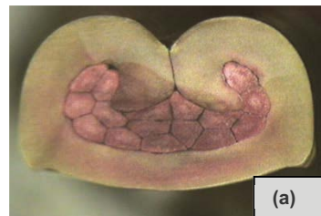
Significant flash can be generated with excessive anvil to crimper clearance, as shown by nominal design condition (a) and +0.003 in over nominal

Dimensional control is clearly critical.