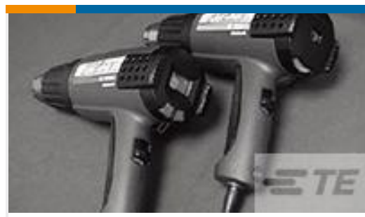
TE Part # CJ2087-000 HL2010E-KIT-120V