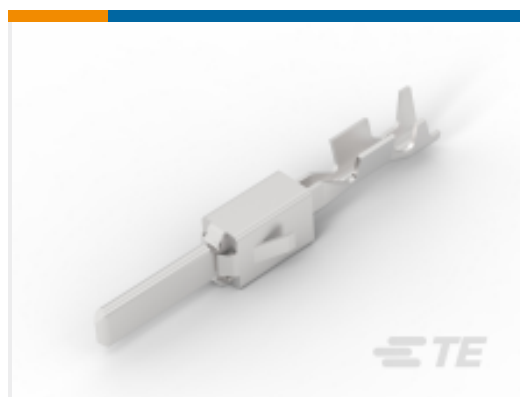
TE Part #1-963745-2 SPECIAL TERMINAL 20-17 AWG SLIPB LP