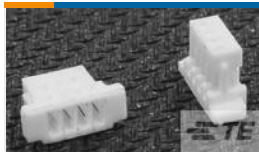
TE Part #1470364-2 1.0MM W T B RECPT, 2POS HOUSING