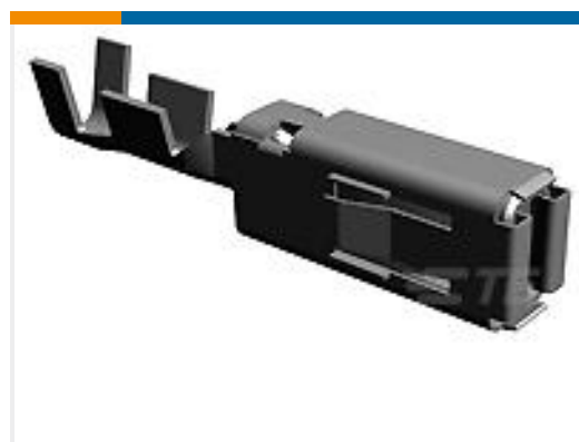
TE Part #1-968873-3 AMP MCP 2.8, CONTACT (LP)