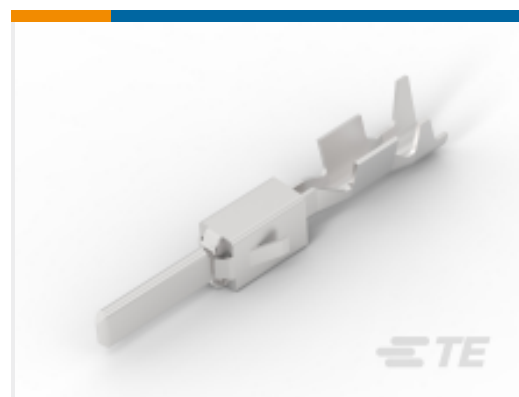
TE Part #1-963746-2 SPECIAL TERMINAL 17-13 AWG SLIPBR LP