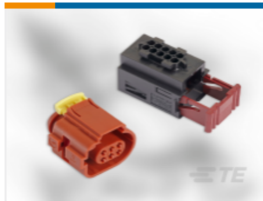
TE Part #1-965641-3 TIMER, CONNECTOR HOUSING