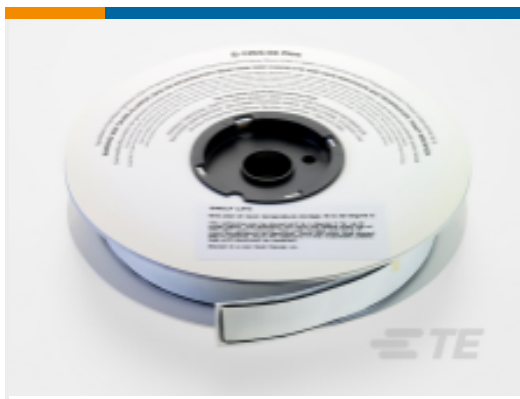
TE Part # 195133-000 S1255-04-3/4X100FT