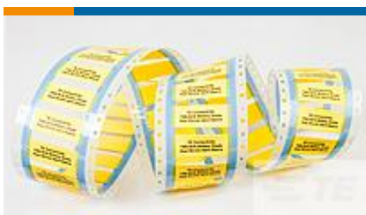
TE Part #151213-000 TMS-SCE-1K-3/16-2.0-S2-4