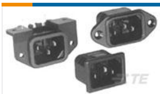
TE Part #1609133-3 6ESRM-3=F6920