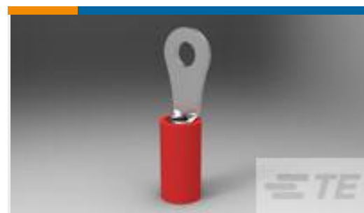
TE Part #320553 PIDG R 22-16 COMM 22-18 MIL 4