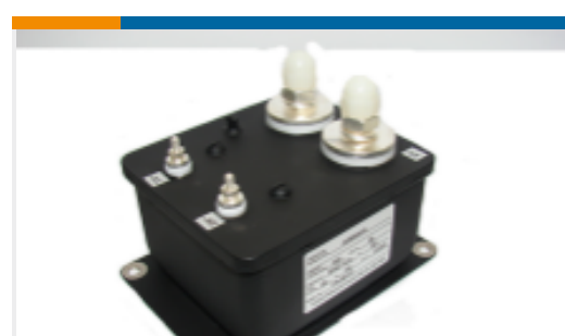
TE Part #1616977-6 AH600A1C=CONTACTOR SPST 600 AMPS HERM