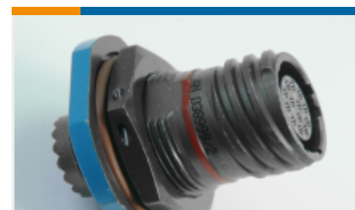
TE Part #YDTS24W25-19SNV001 RECP ASSY