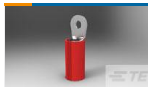
TE Part #131648-1 TERMINAL RING TONGUE PIDG 22 18