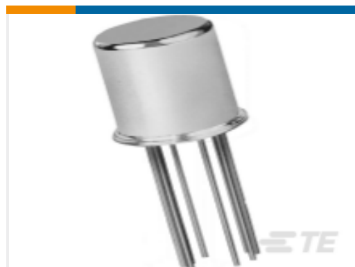
TE Part #2-1617541-3 J1MSP-26XM=M39016/10- 024M