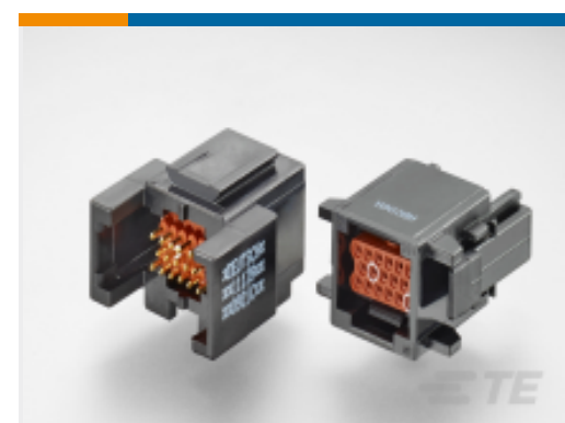
TE Part #ABC06Y-20P-4048 IN-LINE PLUG