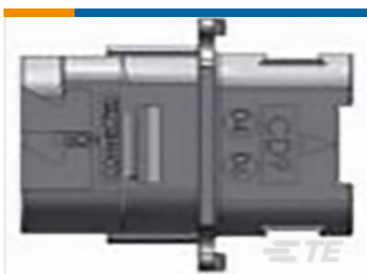
TE Part # ZPF000000000104587 DMC-MD 26 B