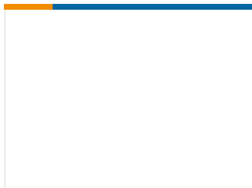
TE Part #CTM-20-090 JUNCTION ASSY