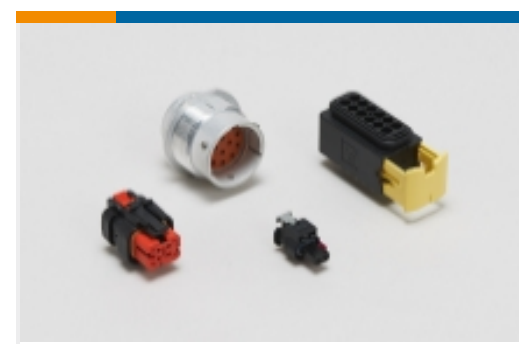
Automotive, Truck, Bus, & Off-Road Housings(10)