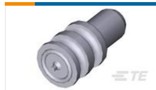
TE Part #963531-1 BLINDSTOPFEN