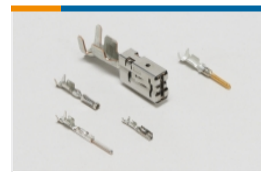
Automotive, Truck, Bus, & Off-Road Terminals(5)