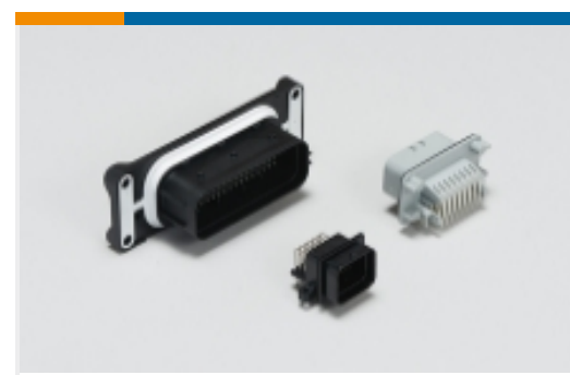
Automotive, Truck, Bus, & Off-Road Headers(23)