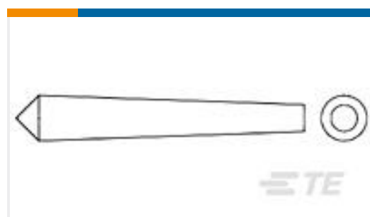
TE Part #770678-1 SEAL PLUG, AMPSEAL