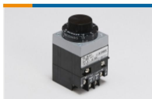
Time Delay Relays(214)