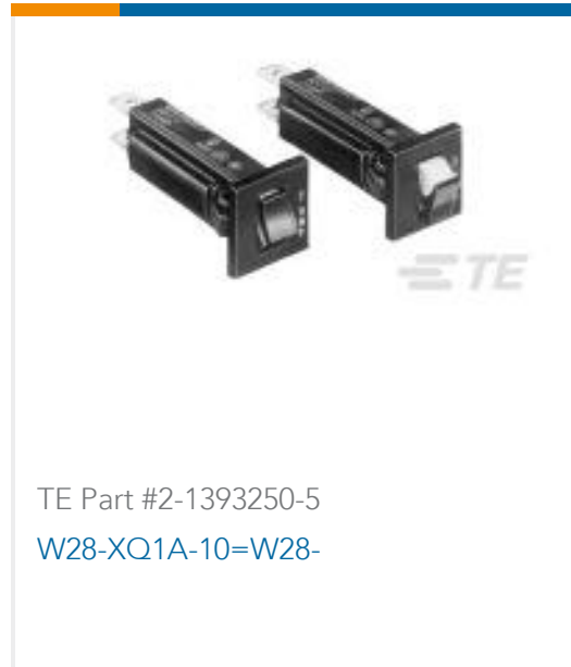
TE Part #2-1393250-5 W28-XQ1A-10=W28-