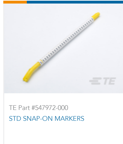
TE Part #547972-000 STD SNAP-ON MARKERS