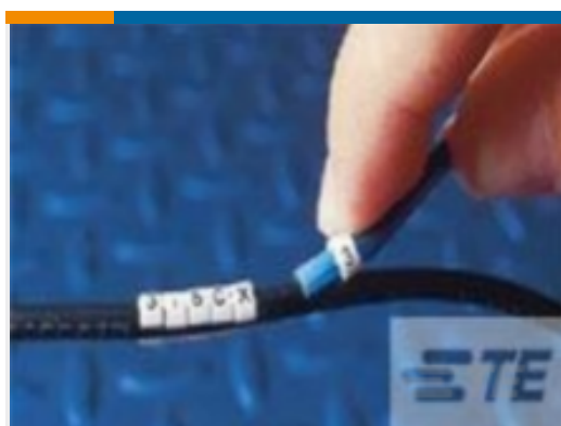
TE Part # 4-1768044-3 STD09W-DOT