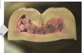
Visible deformation of outer crimp surface because of indentation from material buildup on crimper.

Chromium plating has the ability to be applied uniformly and consistently and exhibits excellent adhesion to the base metals. The unique benefits of chromium plating, such as ease of application, consistency of plating, adhesion to base metal, extremely low coefficient of friction, very high hardness, and resistance to adhesion, make it truly difficult to match in crimp performance and durability. However many alternative coatings are being attempted, and some show excellent promise in specific applications.