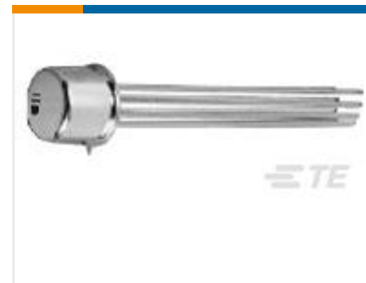
TE Part #1-1617108-1 HMD-12B = HM RELAY 0.5" LEADS