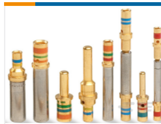
TE Part # ZPF000000000003649 724-8021-22