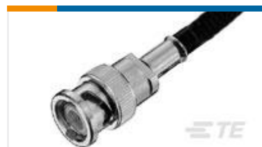
TE Part #2-5330358-2 BNC PLUG KIT