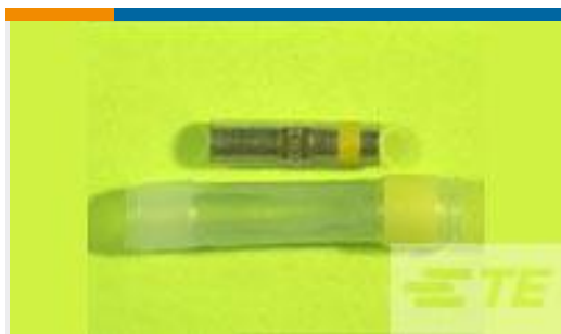
TE Part # 650076-000 D-436-38