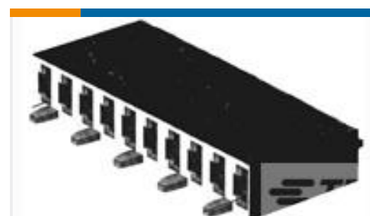
TE Part #1-87025-3 04 MODI CRMP S-I HSG SR .156CL