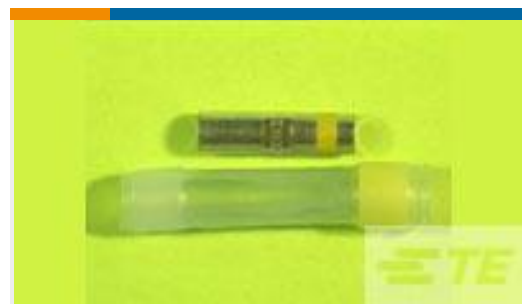
TE Part # 650075-000 D-436-37