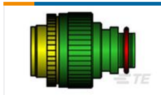
TE Part #535295-000 TXR30AB00-1010AI2