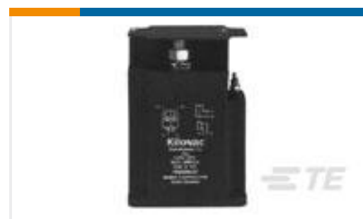
TE Part #2-1618013-6 PD350XB57=RELAY, PRESSURIZED,