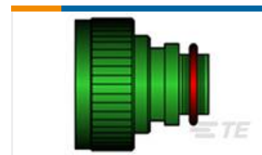
TE Part #850845-000 TXR40AB00-1610BI