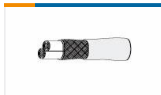
TE Part #325411-000 55A1121-20-9/96-9CS2275