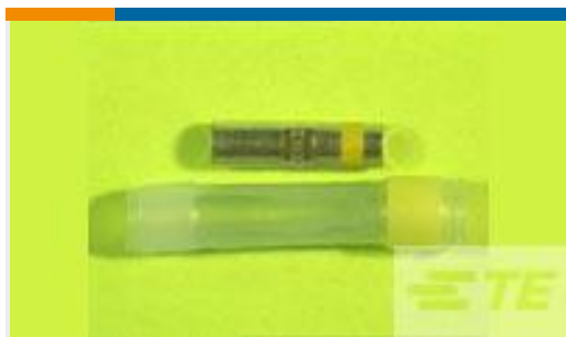
TE Part # 650075-000 D-436-37