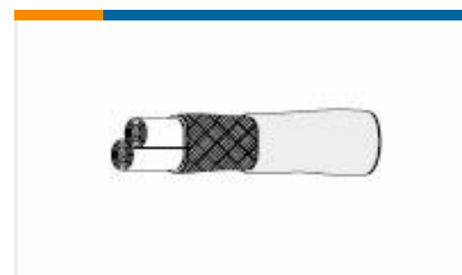
TE Part #934769-000 55A1131-20-MST3-9CS2275