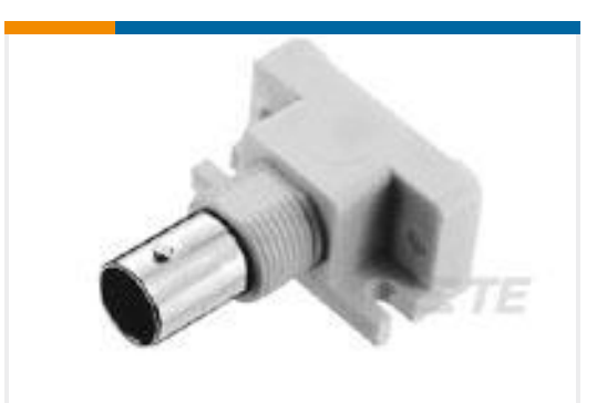
TE Part #226978-1 RTANG JK W/FLANGES, BNC PCB