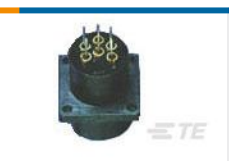
TE Part #447913-1 POSTED CONTACT ASSY