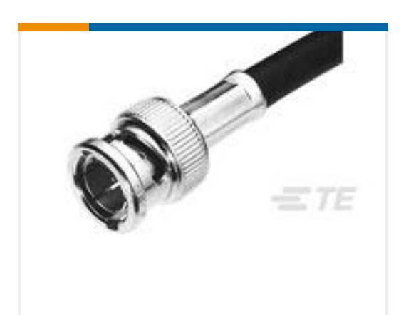
TE Part # 413589-5 KIT PLUG 75 OHM BNC HEX CRIMP