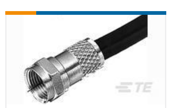
TE Part # 221539-7 PLUG, F SERIES, FERRULE, RG-6