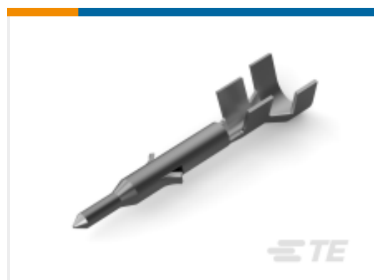
TE Part # 794406-1 MINI UMNL CONT 20-16AWG SN