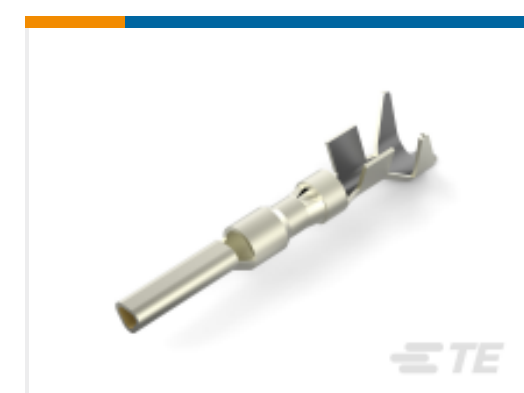
TE Part # 1-794223-0 MINI UMNL2 SCKT 20-16AWG 30AU