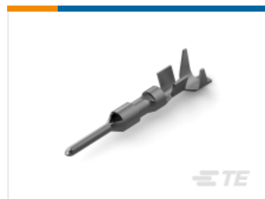
TE Part # 794222-1 MINI UMNL2 PIN 20-16AWG SN