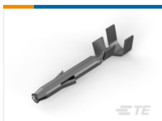
TE Part # 794407-4 MINI UNML SCKT 20-16 AWG SN