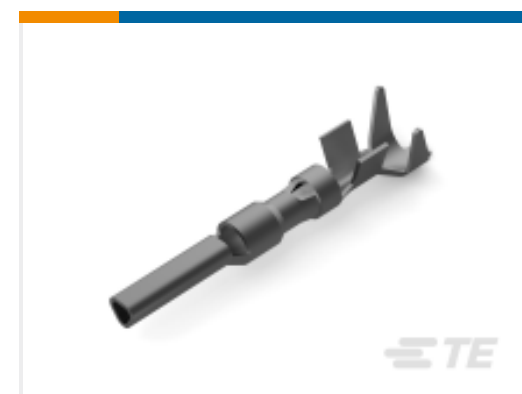
TE Part # 794223-1 MINI UMNL2 SCKT 20-16AWG SN