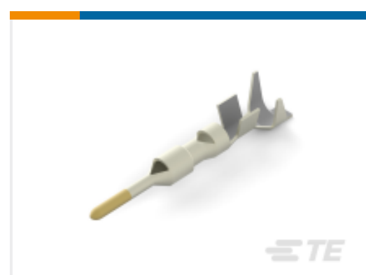
TE Part # 1-794222-0 MINI UMNL2 PIN 20-16AWG AU LF