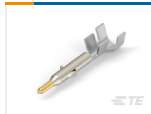
TE Part # 794406-3 MINI UMNL CONT 20-16AWG AU