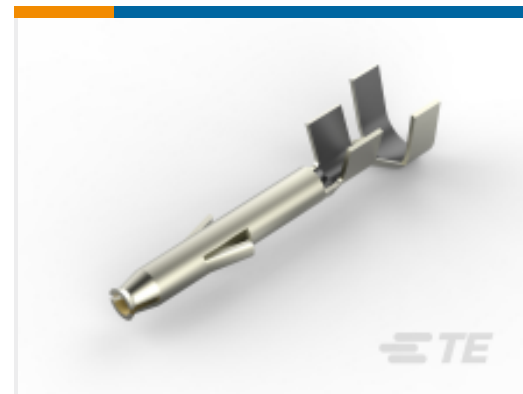
TE Part # 1-794407-0 MINI UMNL SOK 20-16 AWG AU LF