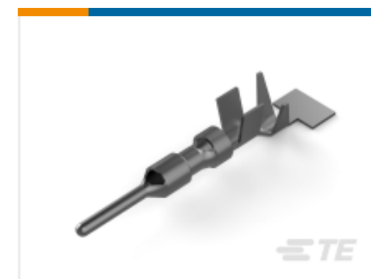
TE Part # 794230-1 MINI UMNL2 PIN 20-16AWG LP SN