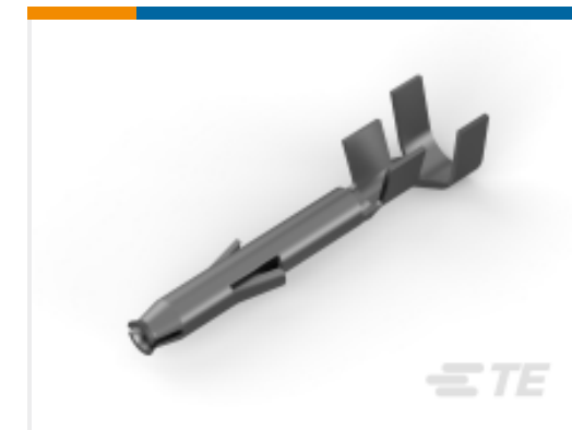
TE Part # 794407-1 MINI UNML SCKT 20-16 AWG SN