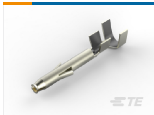
TE Part # 1-794407-1 MINI UMNL SOK 20-16 AWG AU LF