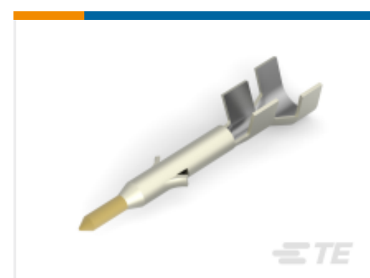
TE Part # 1-794406-0 MINI UMNL SOK 20-16 AWG AU LF