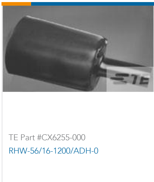
TE Part #CX6255-000 RHW-56/16-1200/ADH-0