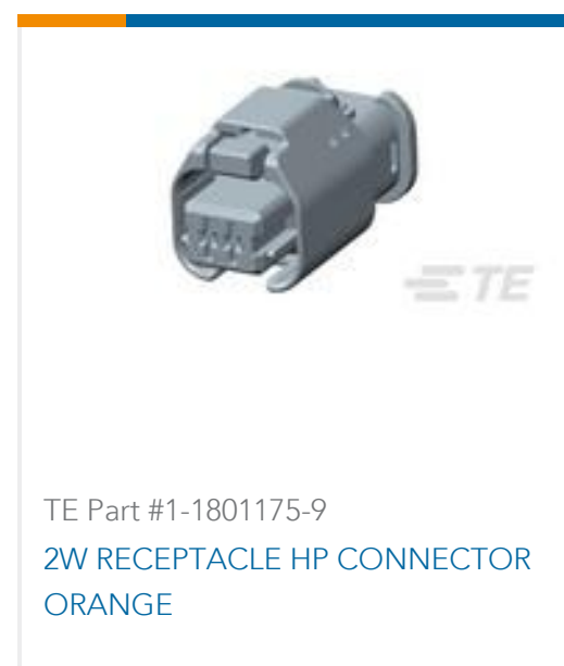
TE Part #1-1801175-9 2W RECEPTACLE HP CONNECTOR ORANGE