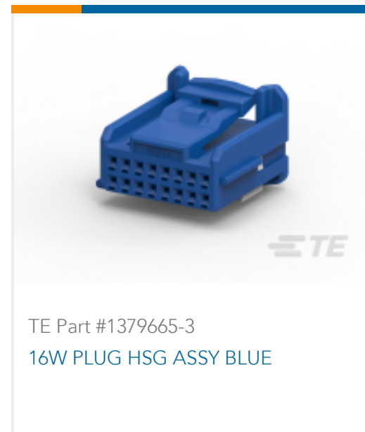
TE Part #1379665-3 16W PLUG HSG ASSY BLUE