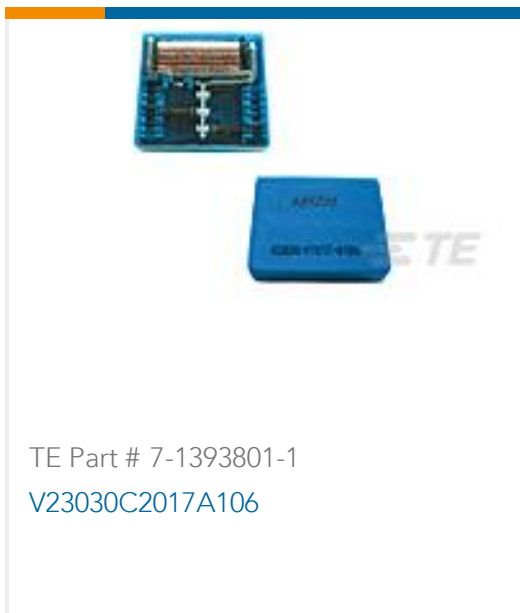
TE Part # 7-1393801-1 V23030C2017A106