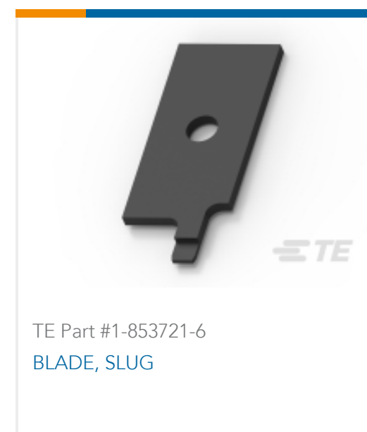
TE Part #1-853721-6 BLADE, SLUG