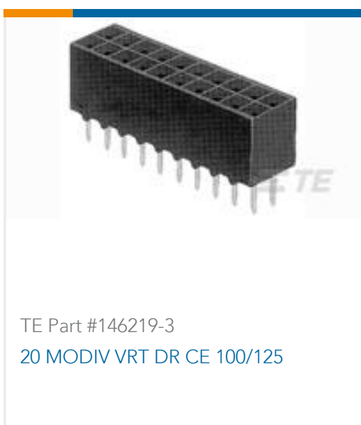
TE Part #146219-3 20 MODIV VRT DR CE 100/125