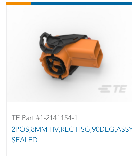
TE Part #1-2141154-1 2POS,8MM HV,REC HSG,90DEG,ASSY, SEALED