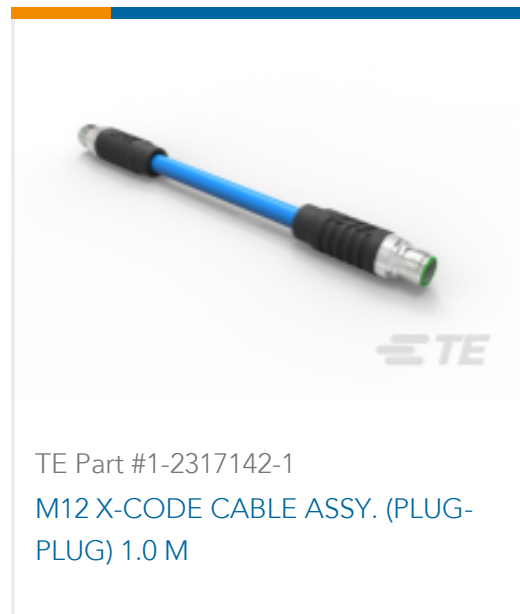
TE Part #1-2317142-1 M12 X-CODE CABLE ASSY. (PLUG-PLUG) 1.0 M