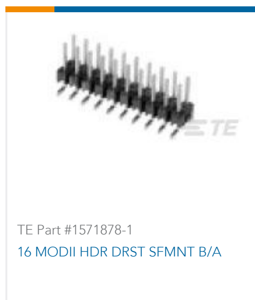
TE Part #1571878-1 16 MODII HDR DRST SFMNT B/A