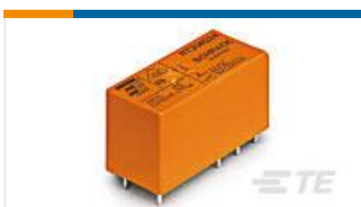
TE Part #1649357-4 RTH14012