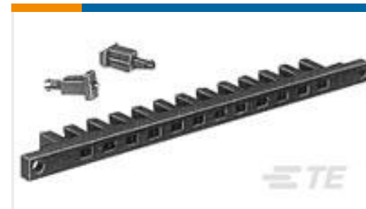
TE Part #926495-2 KEYING BLOCK