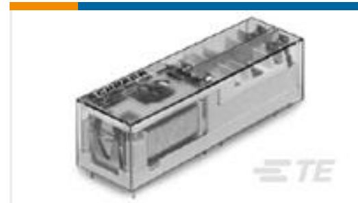
TE Part #1415015-1 SR6A4024 - V23050-A1024-A533