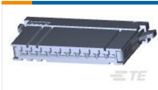
TE Part #1-178288-8 DYNAMIC 3100 REC HSG 10P