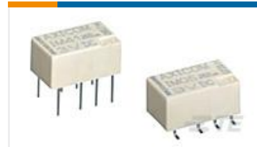
TE Part #1462039-2 IM07CGR=IM RELAY 200MW 24V HDV