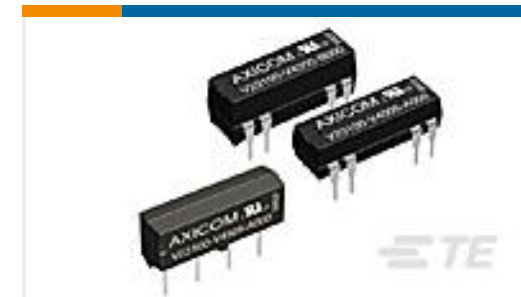
TE Part #1393763-1 V23100V4005A