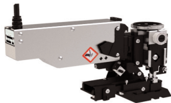
Pacific-Style SF Servo