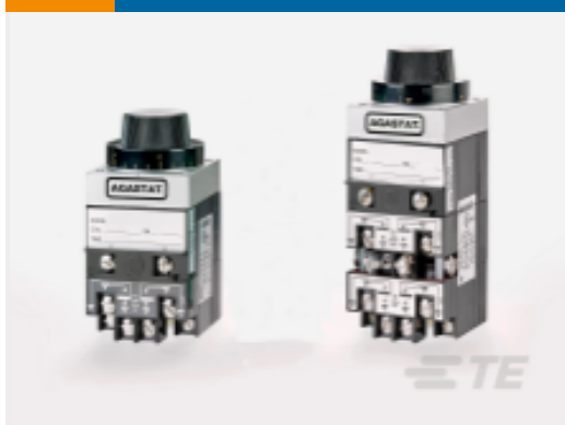
TE Part # 1423162-5 7022AC=RLY,STD,OFF,2P 120VAC,1