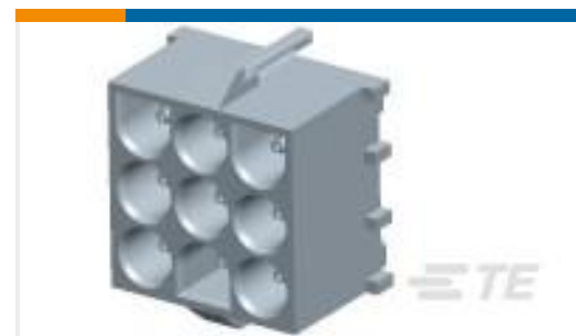
TE Part #1586126-3 9P UMNL PIN HDR ASSY W /O DR LF