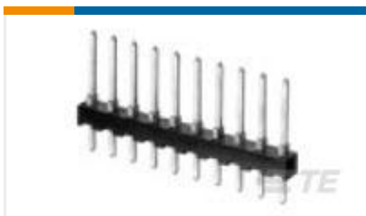
TE Part #6-87348-4 14 MODII HDR SRST UNSHRD .100