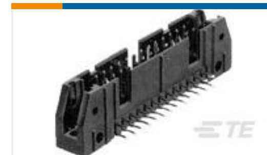
TE Part #102161-2 014 UNIV HDR RA 4S 15DP STD