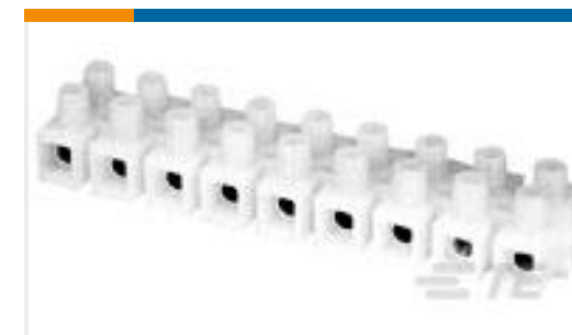
TE Part #1776315-4 TSB200004KDS=EUROPA BL,14.5MM