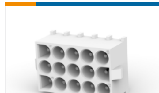
TE Part #1586170-1 15P UMNL PIN HDR 94VO NDH