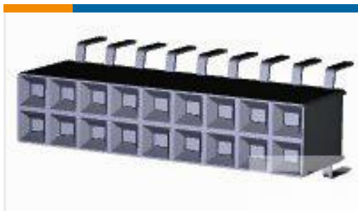
TE Part #1-534267-0 18 MODIV VRT DR OE 100 /125