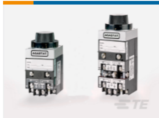
TE Part # 2-1423159-3 7012PC=RLY,STD,ON,2P, 125VDC,15