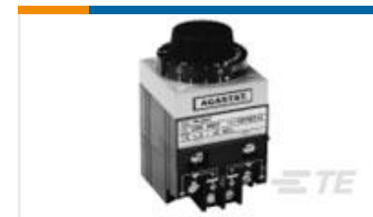
TE Part #8-1472969-6 7022PBX=RLY,STD,OFF,2P, 125V,5S,X OPT