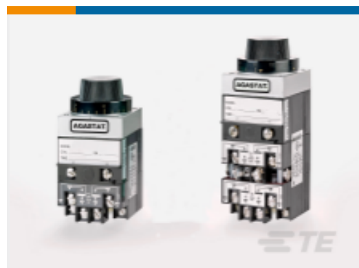
TE Part #4-1423164-9 7022SJ=RLY, STD, OFF, 250 VDC