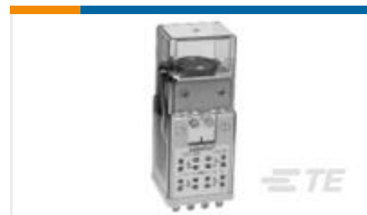
TE Part #1-1423155-4 GPF=RELAY, 250VDC