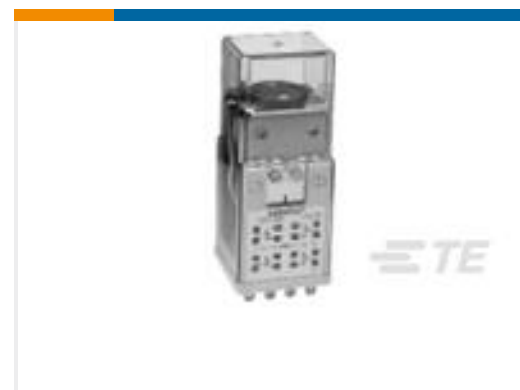
TE Part #1-1423155-5 GPFN=RLY,GEN,PURP, 250VDC