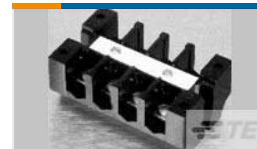
TE Part #4-1437382-0 B106-BU=1 PIECE TERMINAL BLOCK