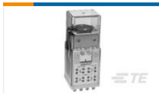
TE Part #1423155-3 GPC=RELAY,48VDC