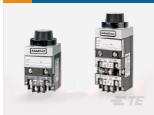
TE Part # 1-1423159-9 7012PB=RLY,STD,ON,2P, 125VDC, 5