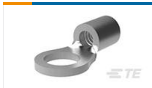
TE Part #2-321684-1 TERMINAL,SOLIS R 16-14 6