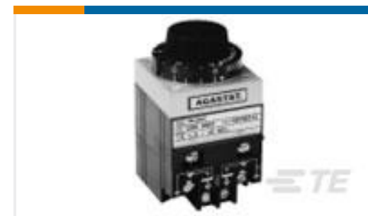
TE Part #5-1423159-6 7012SKX=RLY,STD,ON,2P, 250VDC,