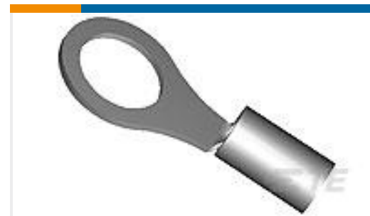
TE Part #324911-1 TERMINAL,SOLIS R 12-10 6 TAPE