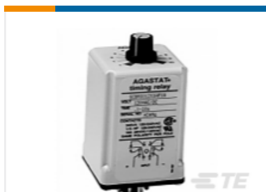
TE Part #1423462-3 SCBRX022XXACXA= 1TO30 SEC