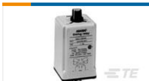
TE Part #1-1437472-8 SSC22EBA=" RLY,OFF,2P, 24VAC/24V