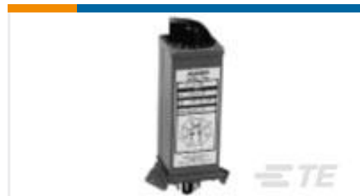
TE Part #1423151-2 2112A4SJ=RLY,MINI,ON, 2P,120VAC