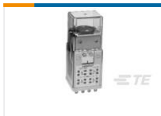
TE Part #1423156-4 GPIN=RLY,120VAC,BOD