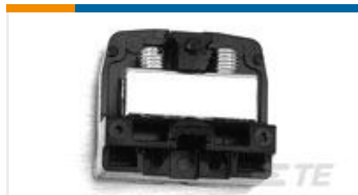
TE Part #1437390-9 0222=**H D SECTIONAL BLOCK