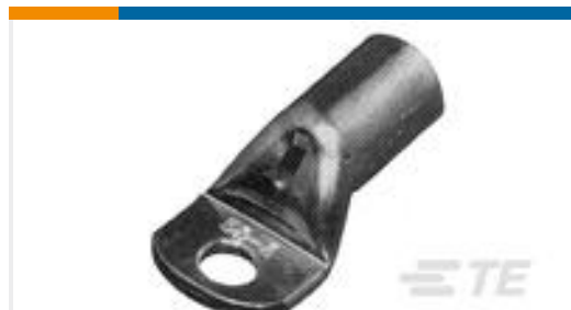
TE Part #710025-7 XCT 50-12