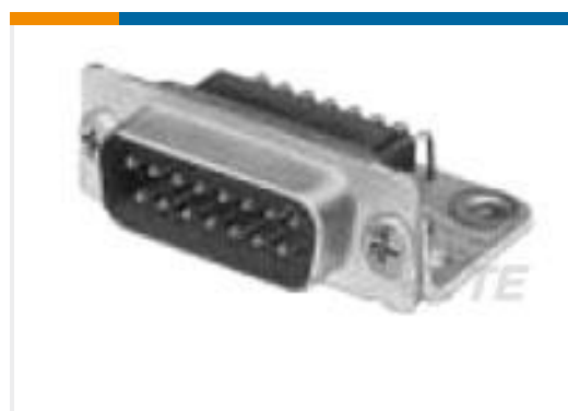
TE Part #205857-1 25 PLUG RA/MS STD