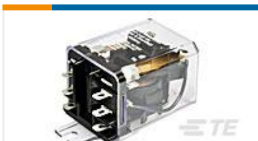
TE Part #1393115-1 KUIP-11A15-120=KU