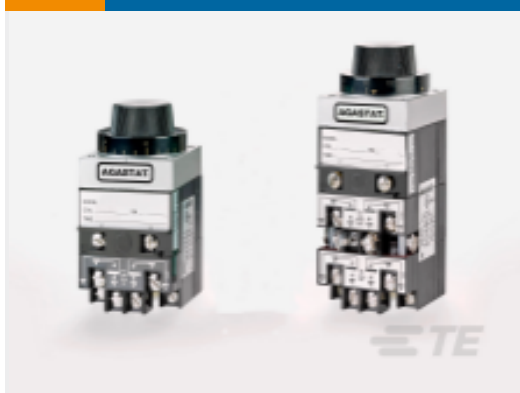
TE Part # 2-1423162-9 7022BK=RLY,STD,OFF, M2P,240VAC,