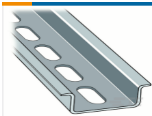
TE Part #1SNA178529R0400 PR50