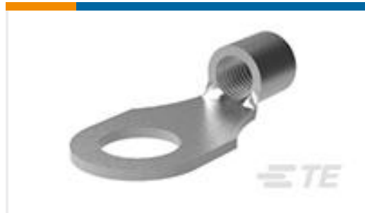
TE Part #1-321828-0 TERM,SOLIS R 14-12 10,TAPE