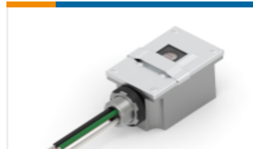
TE Part #635008-000 ALR-AT-20