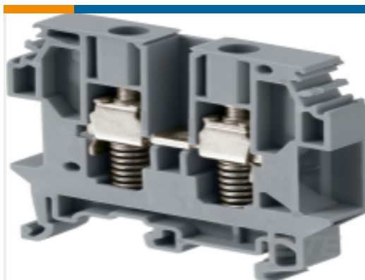
TE Part #1SNA115685R1200 M6/8.RS