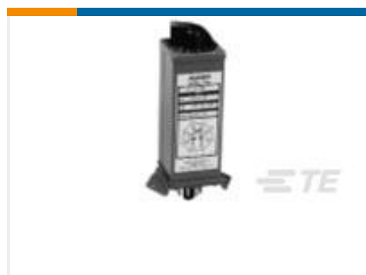
TE Part #1-1423154-0 2122DH3PG=RLY,MINI, OFF,2P,48V,2-60SEC