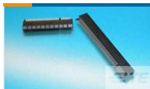
TE Part #1-650728-9 CONN SEC II 19POS 150C /L