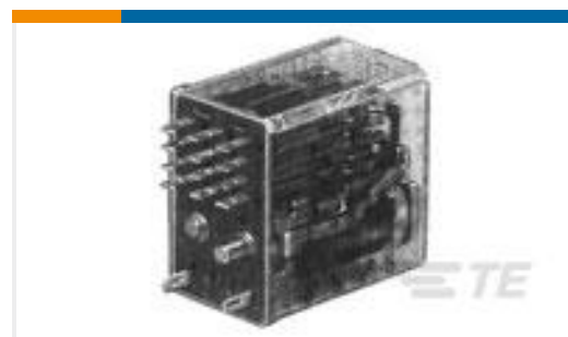
TE Part #7-1393765-3 R10-E1P4-V15.0K=R10