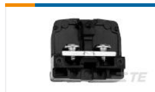
TE Part #2-1437390-7 211=H D SECTIONAL BLOCK