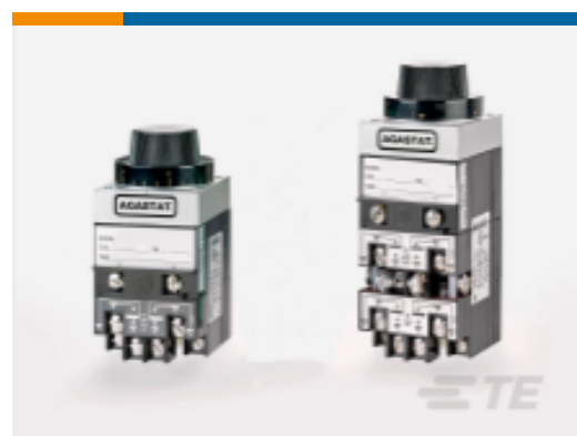
TE Part #3-1437447-2 7012PELL=RLY,STD,ON,2P, 125VDC