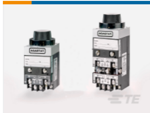
TE Part # 1423157-5 7012AC=RLY,STD,ON,2P, 120VAC,15