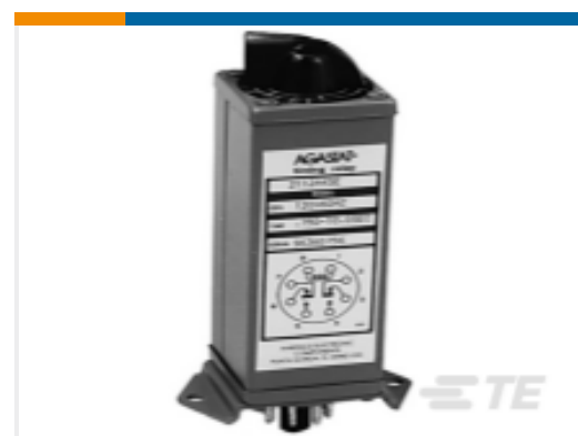
TE Part #4-1423152-7 2112D4NF=RLY,MINI,2P, 28V,30S