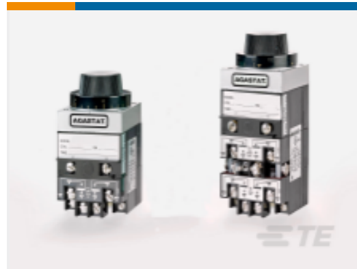
TE Part # 2-1423159-6 7012PD=RLY,STD,ON,2P, 125VDC,50