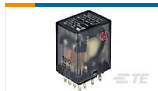
TE Part #6-1393122-5 KHAU-17D12L-48=KH