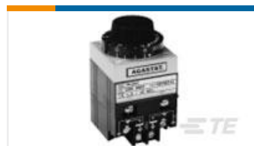
TE Part #1423159-9 7012NJX=RLY,STD,ON,2P, 48VDC,1