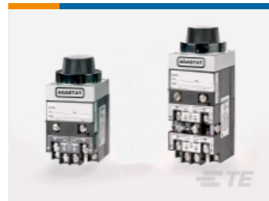
TE Part #1437440-2 7012ABM=RLY,STD,ON,2P, 120VAC,