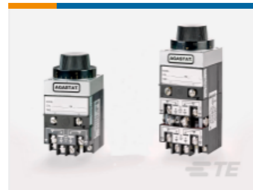
TE Part #1472973-9 7012PKLX=RLY,STD,ON, 2P,125VDC,