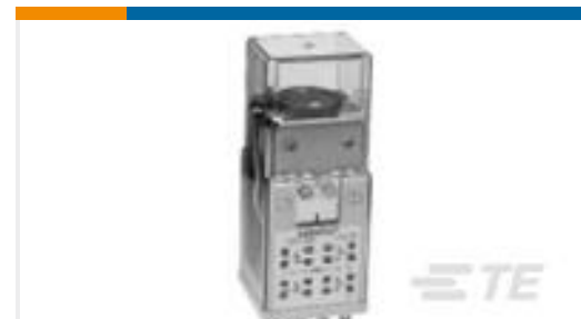
TE Part #1423155-3 GPC=RELAY,48VDC