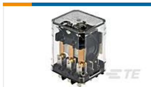
TE Part #6-1423960-9 KUP-17D19-48=RELAY,4C, AGCDO,QC.110,DUST