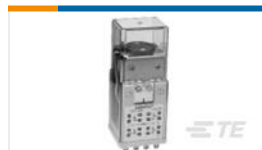
TE Part #1-1423155-5 GPFN=RLY,GEN,PURP, 250VDC