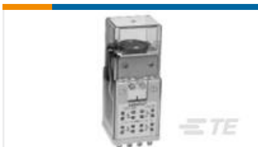
TE Part #1423155-3 GPC=RELAY,48VDC