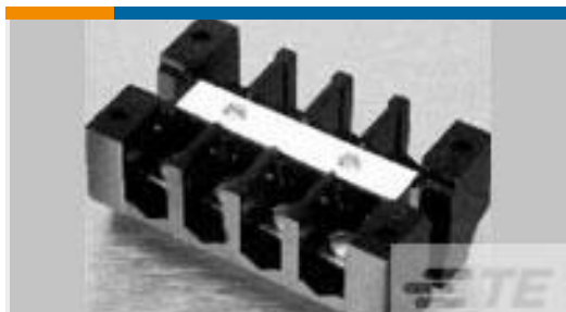
TE Part #4-1437382-0 B106-BU=1 PIECE TERMINAL BLOCK