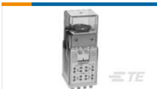
TE Part #1-1423155-4 GPF=RELAY, 250VDC