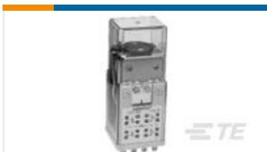
TE Part #1-1423155-5 GPFN=RLY,GEN,PURP, 250VDC