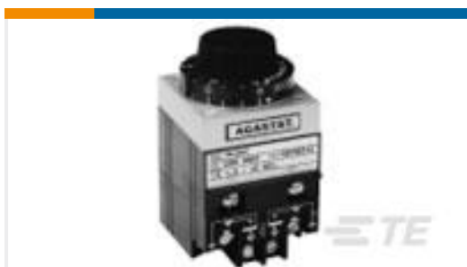
TE Part #3-1423162-9 7022BFX=RLY,STD,OFF,2P, 240VAC