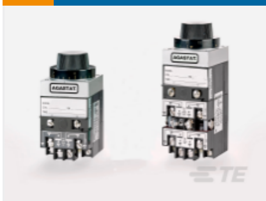
TE Part # 1-1423162-8 7022AK=RLY,STD,OFF,2P, 120VAC,1