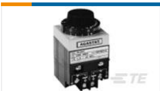
TE Part #3-1423157-5 7012BJX=RLY,STD,ON,2P, 240VAC,