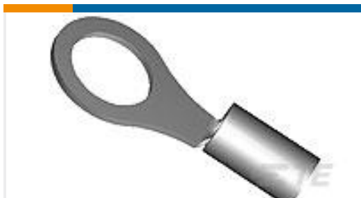
TE Part #324911-1 TERMINAL,SOLIS R 12-10 6 TAPE