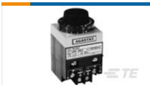
TE Part #5-1423159-6 7012SKX=RLY,STD,ON,2P, 250VDC,