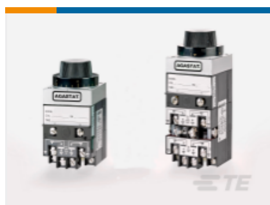
TE Part #7-1472995-0 7012WDS=RLY,STD,ON, 2P,96V,50S,S