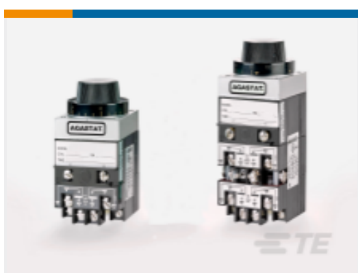
TE Part #9-1755142-1 7022NKIST=RLY,STD,OFF, 2P,48V,300S,I