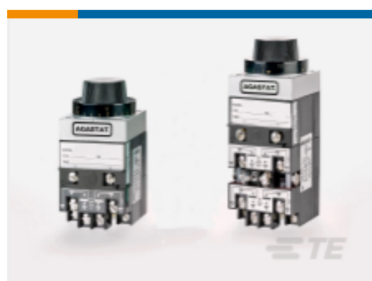
TE Part # 2-1423162-9 7022BK=RLY,STD,OFF, M2P,240VAC,