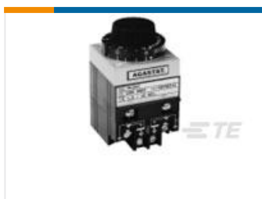
TE Part #6-1755142-4 7022WDIM=RLY,STD,OFF, 2P,96V,50S,I,M