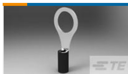
TE Part #342066 16-14 H.D.R/T 1/2" STUD BLACK