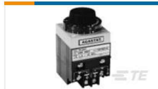
TE Part #3-1423157-3 7012BF=RLY,STD,ON,2P, 240VAC,1