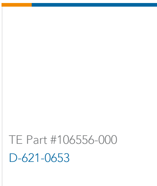
TE Part #106556-000 D-621-0653