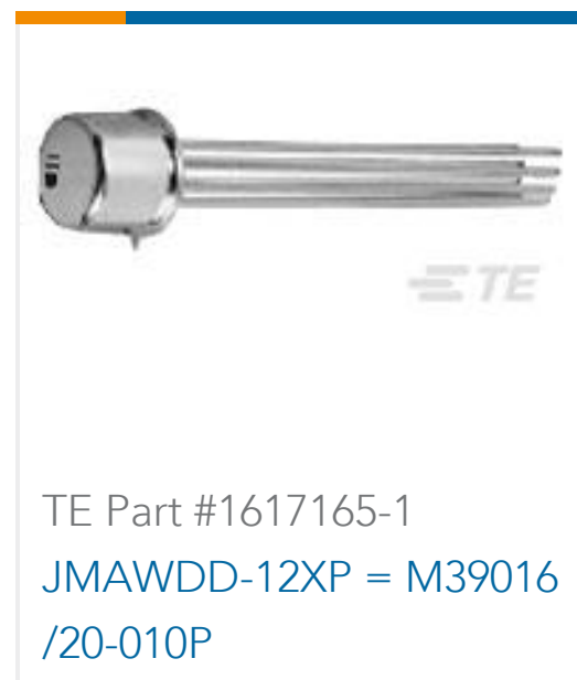
TE Part #1617165-1 JMAWDD-12XP = M39016 /20-010P