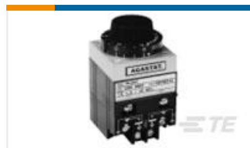
TE Part #1423165-1 7024AA=RLY,STD,OFF,4P, 120VAC,1