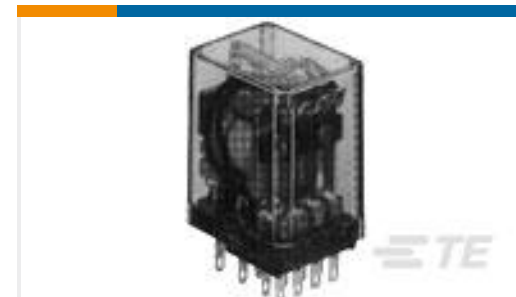
TE Part #4-1393123-2 KHU-17D11-48=KH