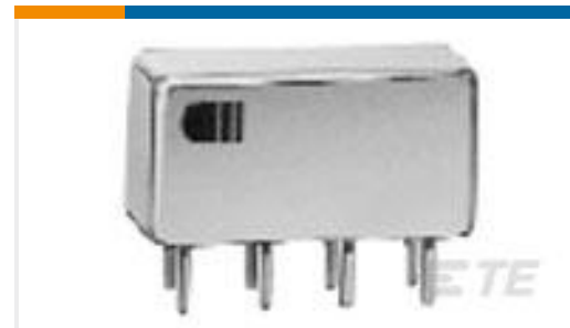
TE Part #3-1617028-1 HFW1105D00 = HFW 1/2 SIZE RELA