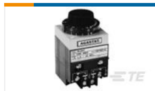
TE Part #1-1423159-2 7012OC=RLY,STD,ON,2P, 24VDC,15