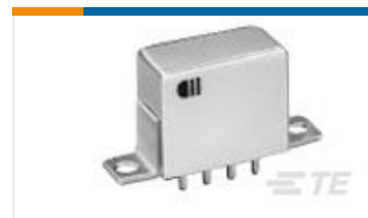
TE Part #4-1617004-2 B07D932BC4-0263 = MS27245-6