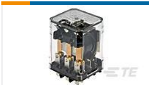
TE Part #6-1393118-4 KUP-5A55-24=KU