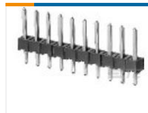
TE Part #146281-4 04 MODII HDR SRST B/A . 100CL