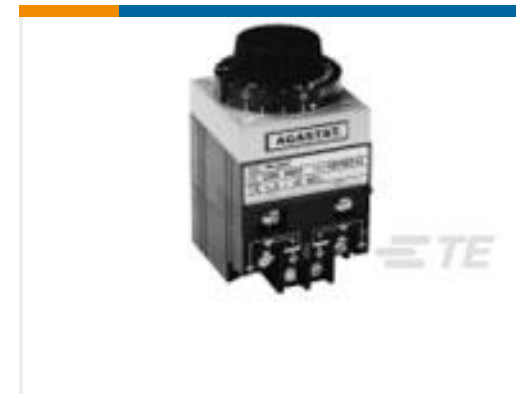
TE Part #3-1423159-4 7012PJL=RLY,STD,ON,2P, 125VDC,