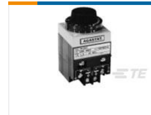
TE Part #3-1423164-1 7022PJ=RLY,STD,OFF,2P, 125VDC,