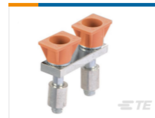
TE Part #1SNK916310R0000 JB16-10