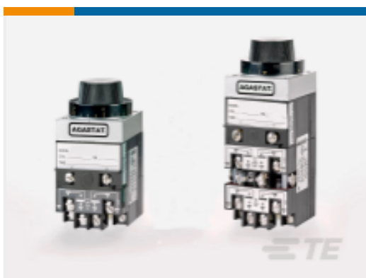
TE Part #4-1423164-9 7022SJ=RLY, STD, OFF, 250 VDC