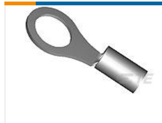
TE Part #320760 TERM BODY-RING TONGUE