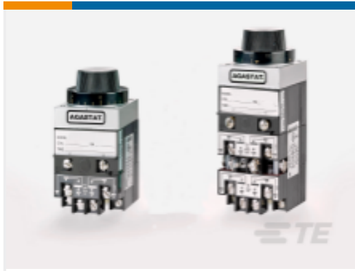
TE Part # 2-1423162-9 7022BK=RLY,STD,OFF, M2P,240VAC,