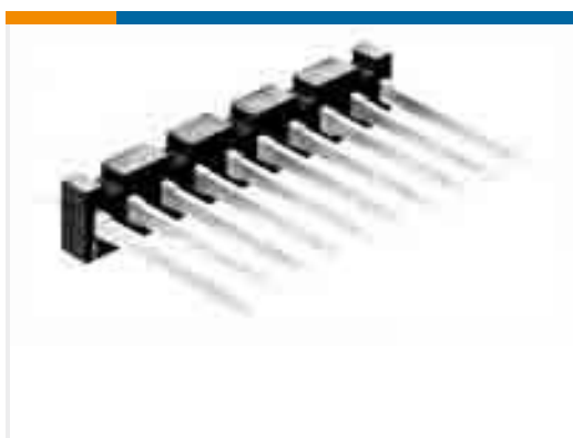
TE Part #86469-5 05 MODI HDR SRST .156CL