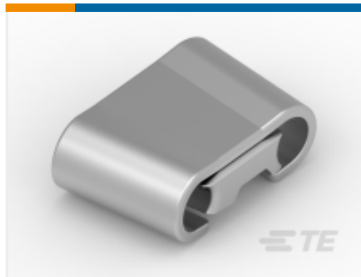
TE Part #109433-1 AMPACT ASSY,1272ACSR /954ACSR