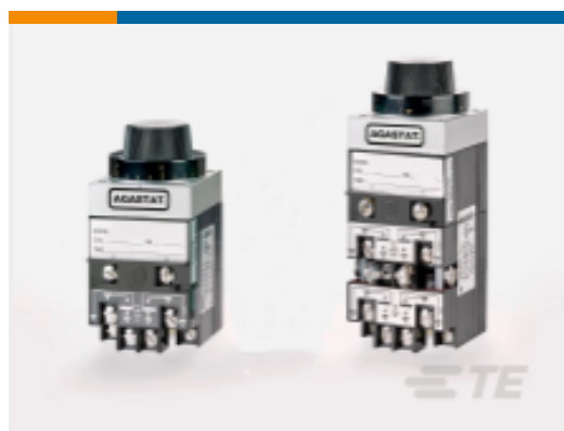
TE Part #8-1437487-2 7012OBLV=24V DC 0.5-5.0 SECS