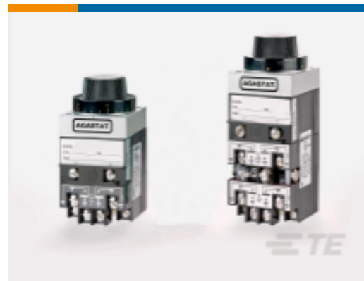
TE Part #6-1423157-2 7012ADT=RLY,STD,ON,2P, 120AC,5