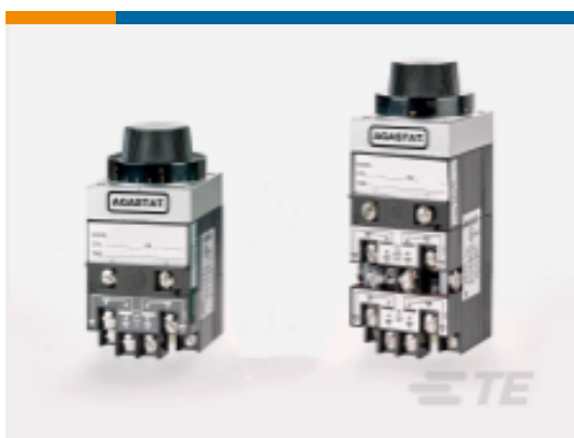
TE Part #7-1423162-5 7022ACX=RLY,STD,OFF, 2P,120VAC,15SEC,X OP