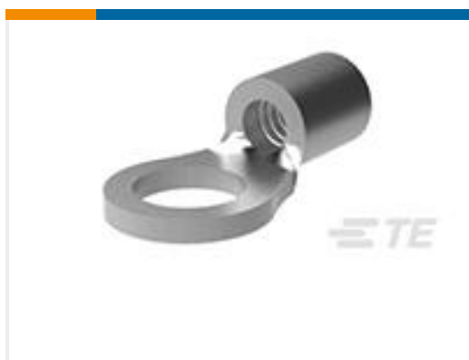
TE Part #8-322454-2 TERMINAL,SOLIS R 12-10 8