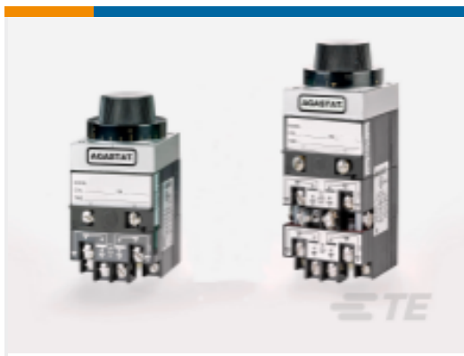
TE Part # 2-1423159-6 7012PD=RLY,STD,ON,2P, 125VDC,50