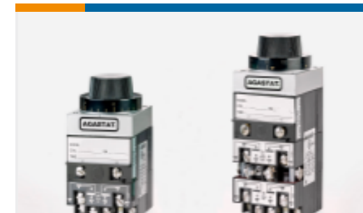
TE Part #2-1472973-0 7012ZB=RLY,STD,ON,2P, 220VDC,5SEC