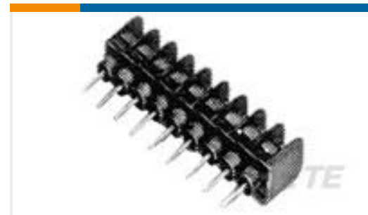
TE Part #5-796985-1 JC6-P108-25=JC6 ASSY