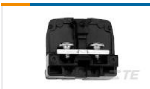
TE Part #2-1437390-7 211=H D SECTIONAL BLOCK