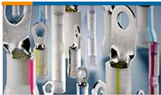
TE Part #53964-1 TERMINAL,PIDG PVF2 R 16-14HD 6