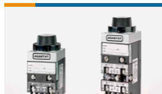
TE Part #4-1472973-9 7012PFL=RLY,STD,ON,2P, 125VDC,10MIN,LL