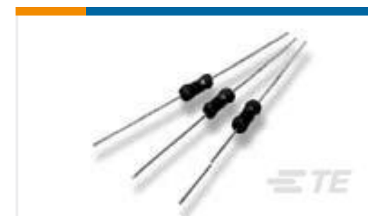
TE Part #1-1879355-8 RR03 5% 22K AMMO