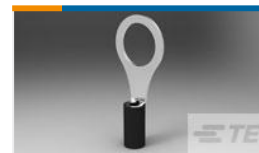
TE Part #342066 16-14 H.D.R/T 1/2" STUD BLACK