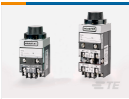
TE Part # 1423162-5 7022AC=RLY,STD,OFF,2P 120VAC,1