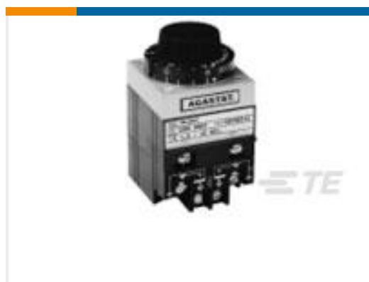
TE Part #6-1755142-4 7022WDIM=RLY,STD,OFF, 2P,96V,50S,I,M