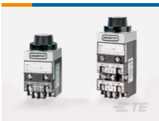
TE Part #7-1472995-0 7012WDS=RLY,STD,ON, 2P,96V,50S,S