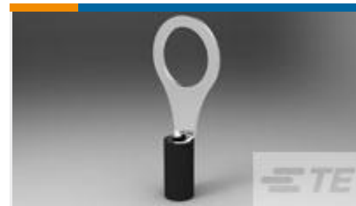
TE Part #342066 16-14 H.D.R/T 1/2" STUD BLACK