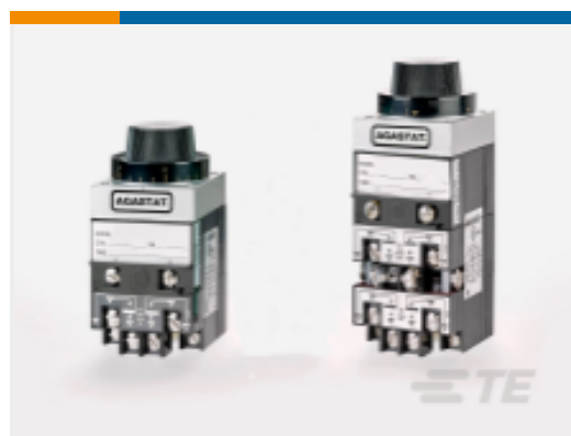
TE Part #9-1755142-1 7022NKIST=RLY,STD,OFF, 2P,48V,300S,I