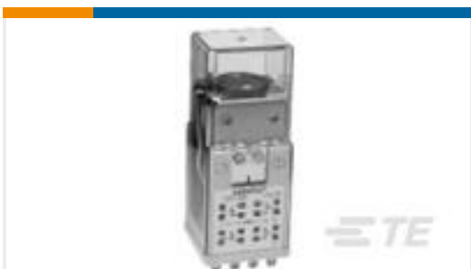
TE Part #1423155-4 GPCN=RELAY, 48VDC W /BLOWOUT DE