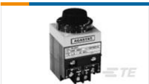
TE Part #4-1423159-3 7012PKX=RLY,STD,ON,2P, 125VDC,