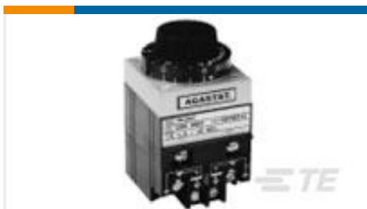
TE Part #3-1423159-8 7012PJX=RLY,STD,ON,2P, 125VDC,