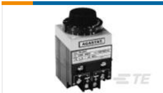
TE Part #7-1423159-5 7012SJSX=RLY,STD,ON,2P, 250VDC