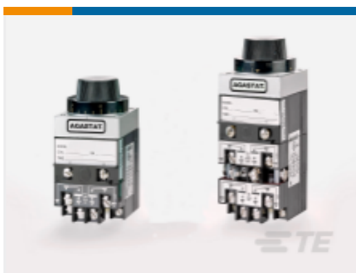
TE Part #7-1472995-0 7012WDS=RLY,STD,ON, 2P,96V,50S,S