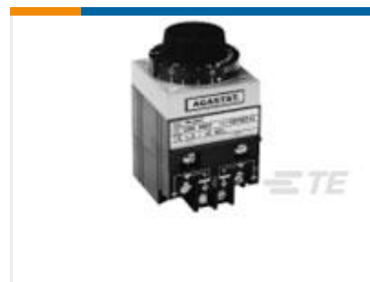
TE Part #6-1755142-4 7022WDIM=RLY,STD,OFF, 2P,96V,50S,I,M