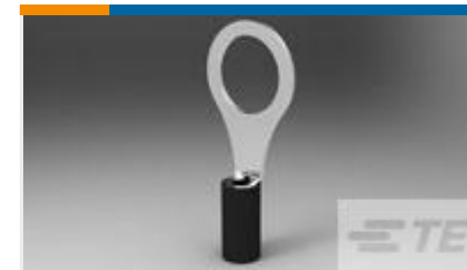
TE Part #342066 16-14 H.D.R/T 1/2" STUD BLACK