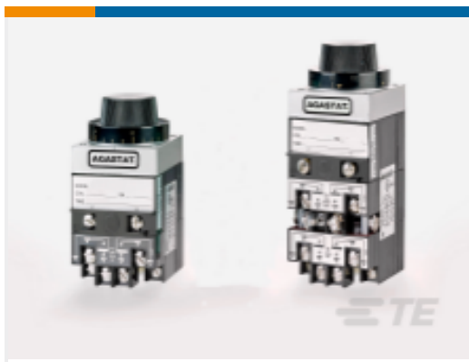
TE Part # 2-1423159-6 7012PD=RLY,STD,ON,2P, 125VDC,50