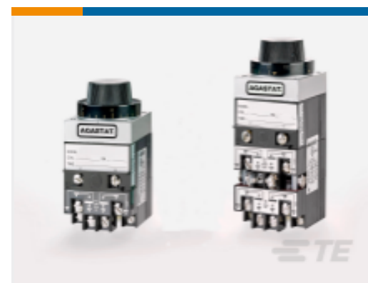
TE Part #9-1755142-1 7022NKIST=RLY,STD,OFF, 2P,48V,300S,I