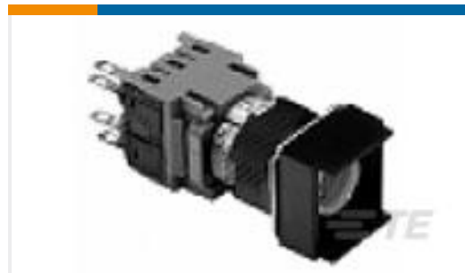
TE Part #2-1437569-6 164SL22=SQ MOM ILL PB 2NO&2NC