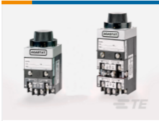
TE Part # 1423157-5 7012AC=RLY,STD,ON,2P, 120VAC,15