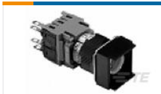
TE Part #2-1437569-5 164SL11=SQ MOM ILL PB 1NO&1NC