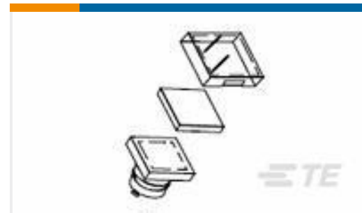
TE Part #8-1437569-4 64S9=COLOR PB CAP WHITE SQ