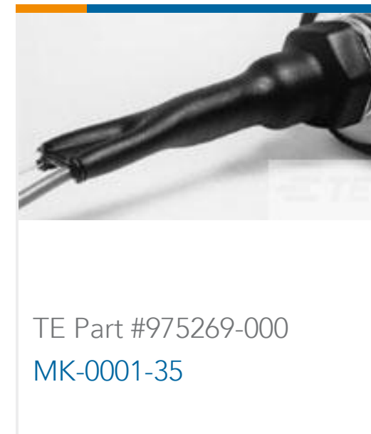
TE Part #975269-000 MK-0001-35