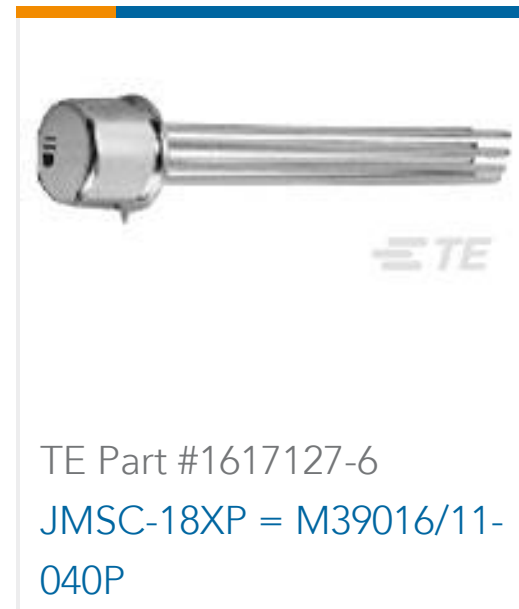
TE Part #1617127-6 JM5C-18XP = M39016/11- 040P