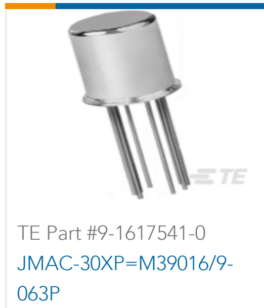
TE Part #9-1617541-0 JMAC-30XP=M39016/9- 063P