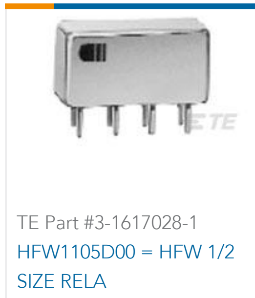
TE Part #3-1617028-1 HFW1105D00 = HFW 1/2 SIZE RELA