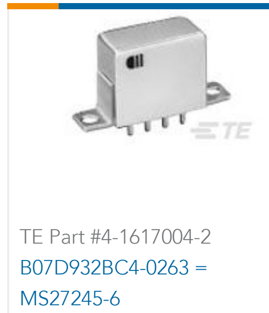
TE Part #4-1617004-2 B07D932BC4-0263 = MS27245-6