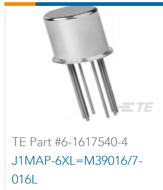
TE Part #6-1617540-4 J1MAP-6XL=M39016/7- 016L