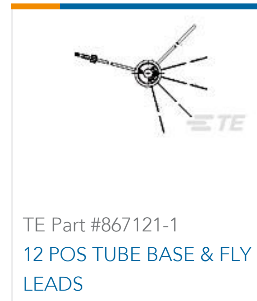
TE Part #867121-1 12 POS TUBE BASE & FLY LEADS