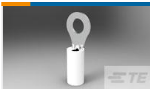
TE Part #50840 TERMINAL,PIDG PTFE R 14 8