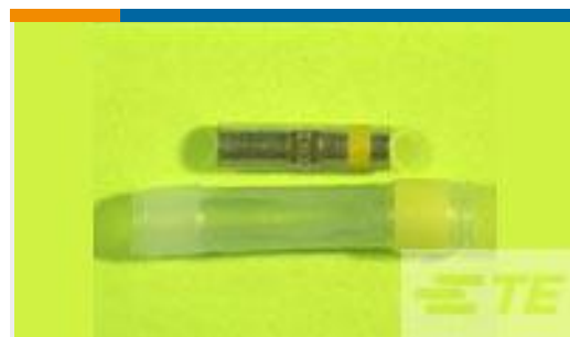
TE Part #650098-000 D-436-75