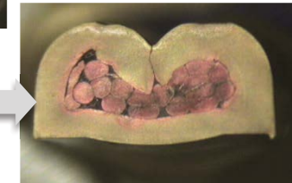
Visible deformation of outer crimp surface because of indentation from material buildup on crimper.

Chromium plating has the ability to be applied uniformly and consistently and exhibits excellent adhesion to the base metals. The unique benefits of chromium plating, such as ease of application, consistency of plating, adhesion to base metal, extremely low coefficient of friction, very high hardness, and resistance to adhesion, make it truly difficult to match in crimp performance and durability. However many alternative coatings are being attempted, and some show excellent promise in specific applications.