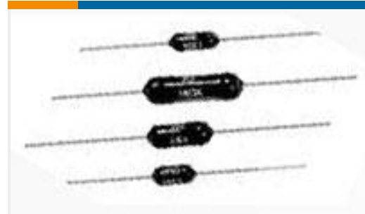
TE Part #6-1879675-8 H8 61K9 0.1% 25PPM