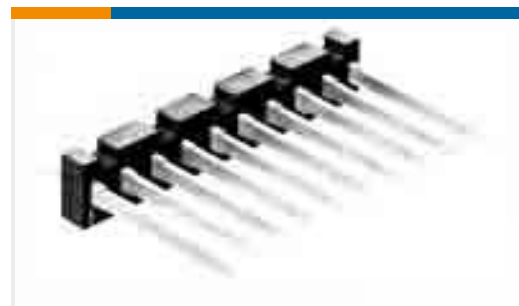
TE Part #85875-1 04 MODI HDR SRST .156CL