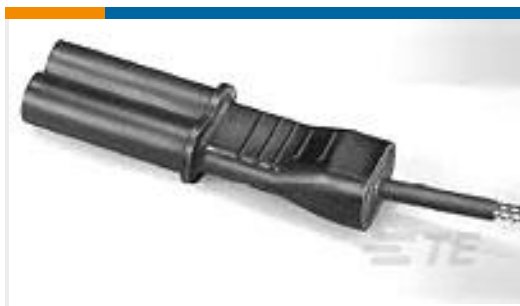
TE Part #862498-1 LGH 2 CAV HSG PLUG