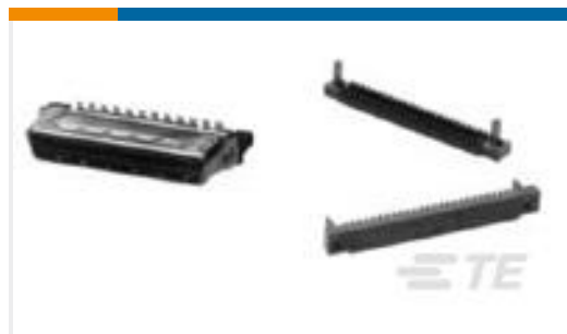
TE Part #1-5750913-2 26 50SR CABLE CONN KIT