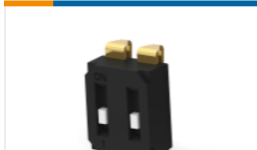
TE Part #3-2319848-3 END STACK DIP2PJRECESSEALTUBE