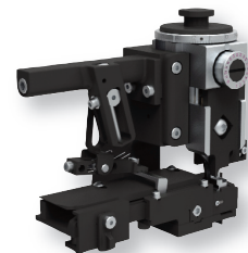
Atlantic-Style SF Mechanical