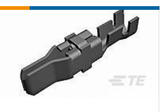
TE Part # 66260-4 MALE CONTACT ASSY. (L.P.)