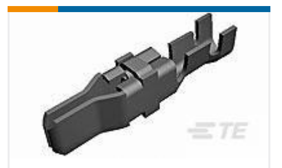
TE Part # 66259-2 MALE CONTACT ASSY. (L.P.)