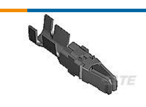
TE Part # 66741-9 TYPE XII FEMALE CONT (STRIP)