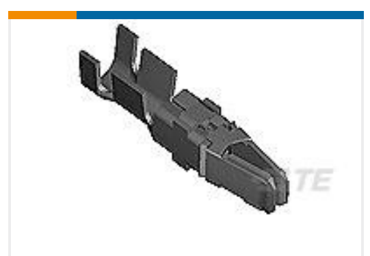
TE Part # 66741-2 TYPE XII FEMALE CONT (L.P.)