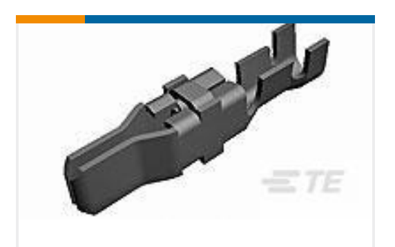
TE Part # 66253-1 MALE CONTACT ASSY. (STRIP)