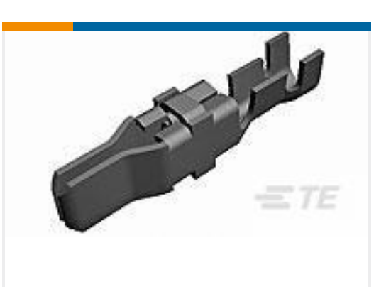
TE Part # 66259-4 MALE CONTACT ASSY. (L.P.)