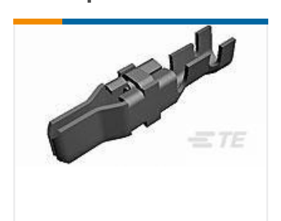
TE Part # 66260-2 MALE CONTACT ASSY. (L.P.)