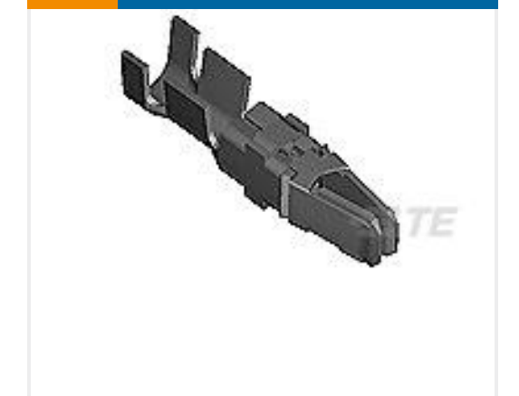
TE Part # 66741-6 TYPE XII FEMALE CONT (L.P.)