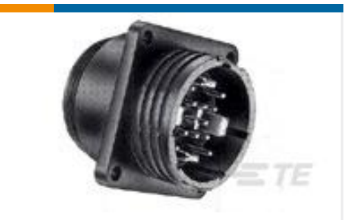
TE Part #206613-1 RECEPT ASSY,SZ 23-22,CPC