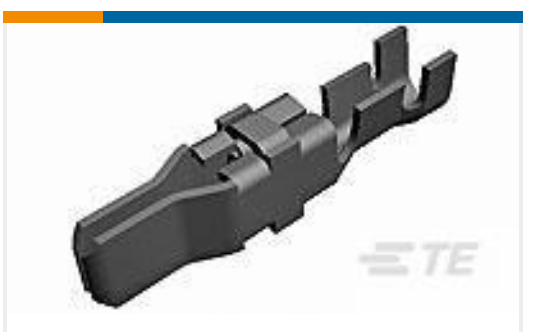
TE Part # 66253-5 MALE CONTACT ASSY. (STRIP)