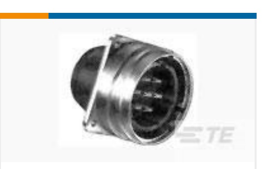
TE Part #208495-1 CMC RECEPTACLE ASSY,SIZE 22