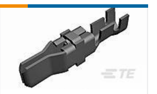
TE Part # 66253-2 MALE CONTACT ASSY. (STRIP)