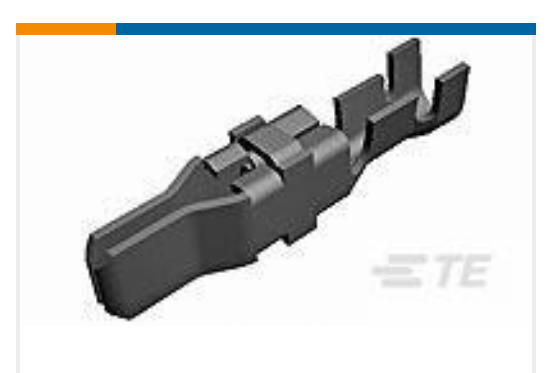
TE Part # 66253-9 MALE CONTACT ASSY. (STRIP)