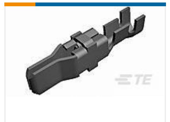
TE Part # 66253-6 MALE CONTACT ASSY (STRIP)