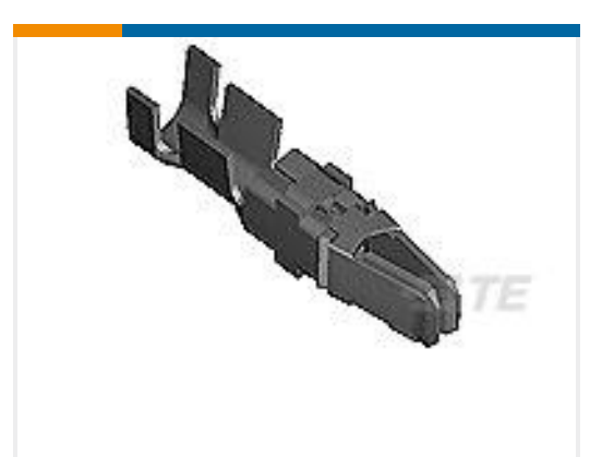
TE Part # 66741-8 TYPE XII FEMALE CONT (L.P.)