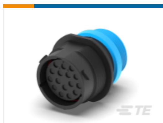
TE Part # HDP24-24-16SE-L015 REC, 16P, BLK, E, THD, 12, S