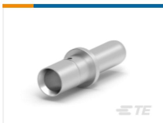
TE Part # SRK-PC-080-25-601 PIN, SOLID, SIZE M8, 25mm2, AG