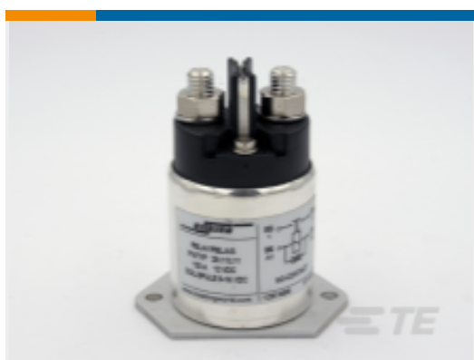
TE Part # K1060489 Relay 29-113-12