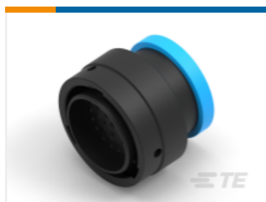
TE Part # YHDP26-24-35PEL017 PLG, 35P, BLK, E, RNG, 16/20, P