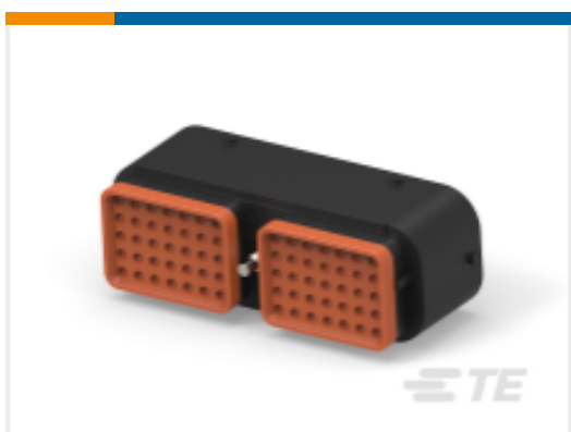
TE Part # DRC16-70SBE-P013UK PLG, 70P, BLK, E, SEAL BOND, B