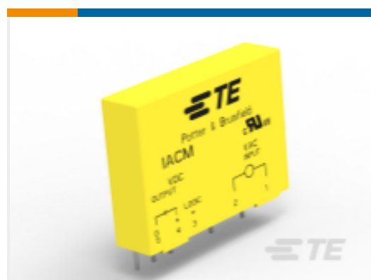
TE Part # 1-1393028-2 SLIM INPUT AC MOD, 5V DC LOGIC-24VAC IP