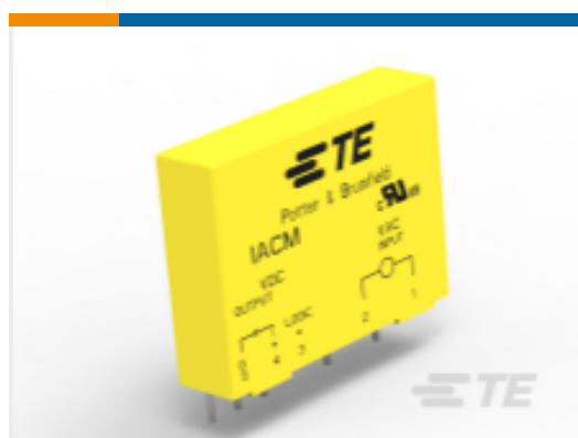
TE Part # 8-1393028-3 SLIM INPUT AC MOD, 15V DC LOGIC-24VAC IP