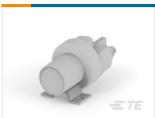
TE Part # K1008699 Relay 26-60-05