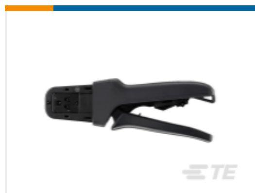
TE Part # DTT-20-03 CRIMP TOOL