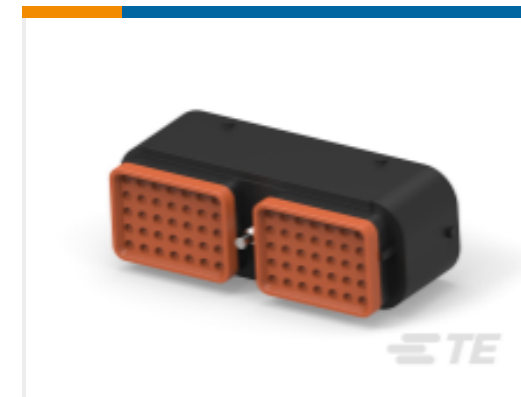
TE Part # DRC16-70SBE-P013UK PLG, 70P, BLK, E, SEAL BOND, B