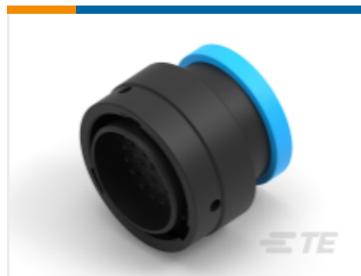
TE Part # YHDP26-24-35PEL017 PLG, 35P, BLK, E, RNG, 16/20, P