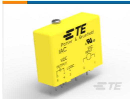
TE Part # 1393028-1 INPUT AC MODULE, 15V DC LOGIC-120VAC IP