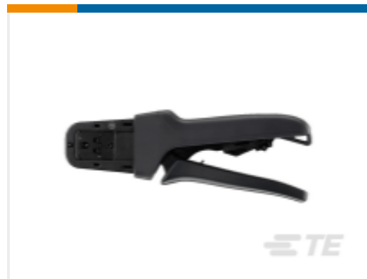
TE Part # DTT-20-03 CRIMP TOOL