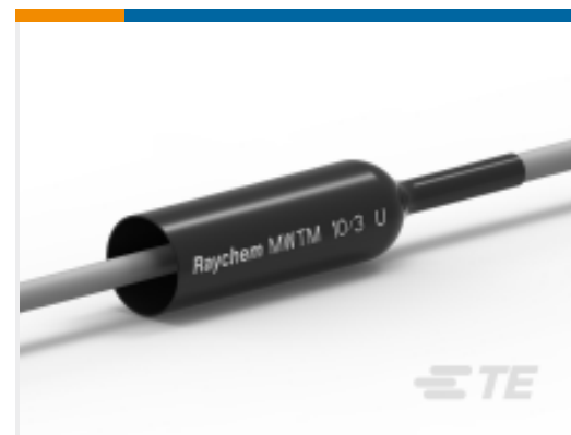
TE Part # 834936-000 MWTM-10/3-100/S(S100)