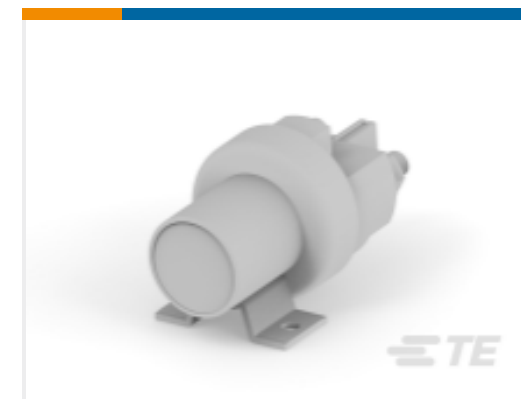
TE Part # K1008699 Relay 26-60-05