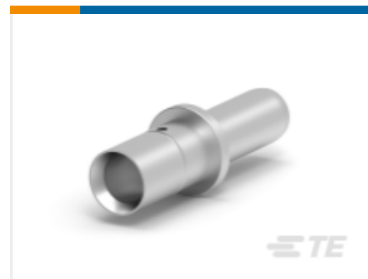
TE Part # SRK-PC-080-25-601 PIN, SOLID, SIZE M8, 25mm2, AG