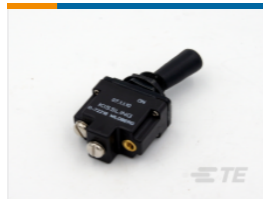
TE Part # K1007153 Toggle Switch 08-1-1-13