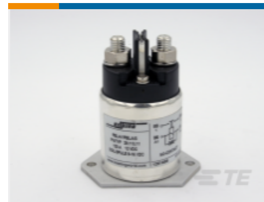
TE Part # K1060489 Relay 29-113-12