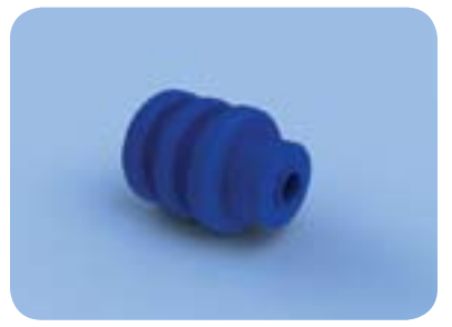
Single Wire Seal