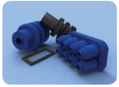
Single & Gang Wire Seals with Interfacial Seal