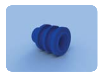
Single Wire Seal