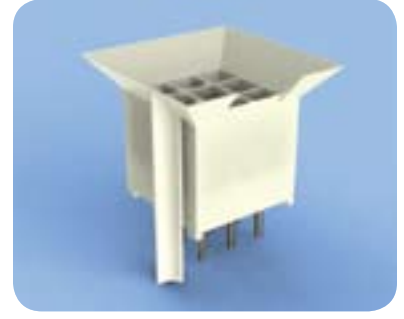
Vertical PC Board Pin Header