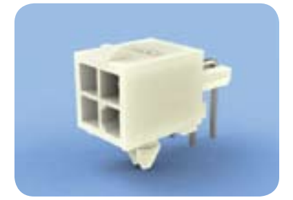
Right Angle Pin Header