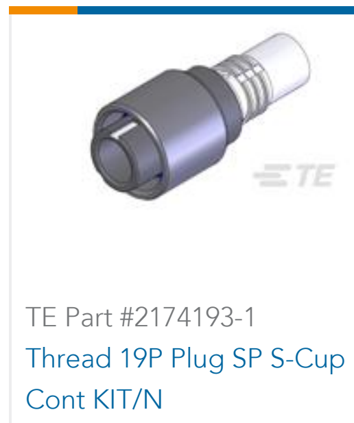
TE Part #2174193-1 Thread 19P Plug SP S-Cup Cont KIT/N