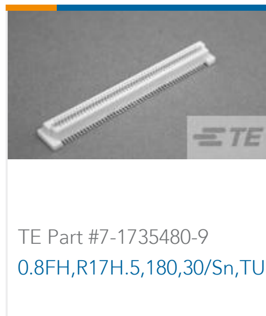
TE Part #7-1735480-9 0.8FH,R17H.5,180,30/Sn,TU