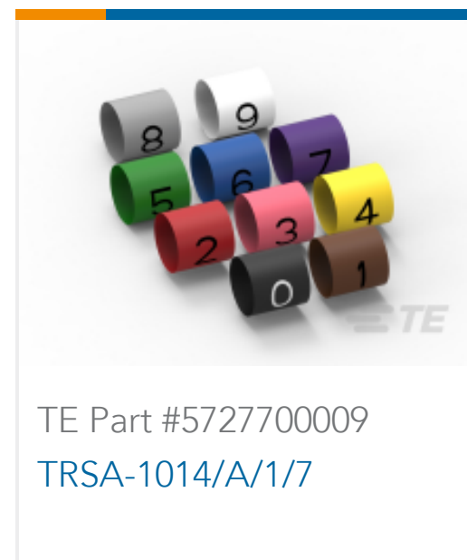
TE Part #5727700009 TRSA-1014/A/1/7