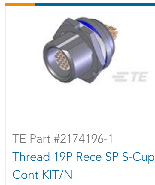
TE Part #2174196-1 Thread 19P Rece SP S-Cup Cont KIT/N