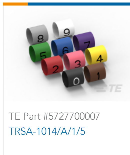
TE Part #5727700007 TRSA-1014/A/1/5