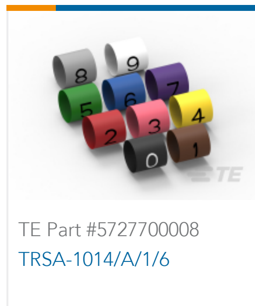
TE Part #5727700008 TRSA-1014/A/1/6