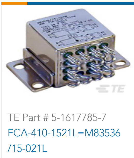
TE Part # 5-1617785-7 FCA-410-1521L=M83536 /15-021L