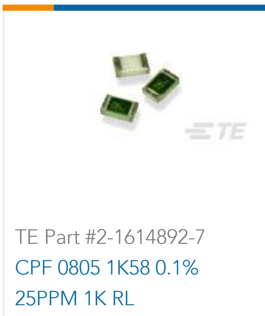
TE Part #2-1614892-7 CPF 0805 1K58 0.1% 25PPM 1K RL