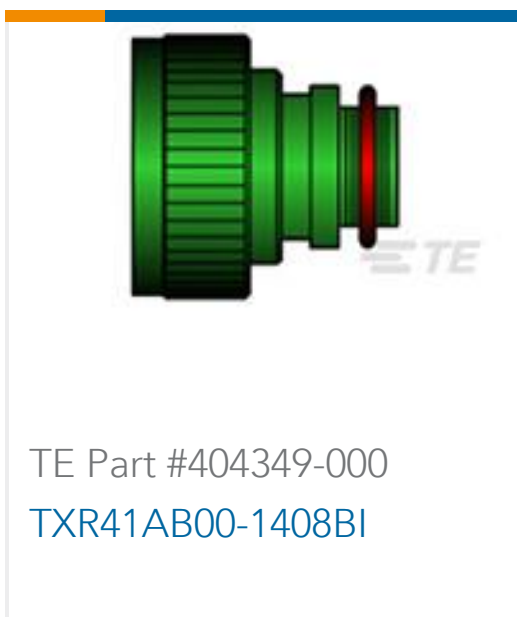
TE Part #404349-000 TXR41AB00-1408BI