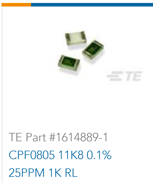
TE Part #1614889-1 CPF0805 11K8 0.1% 25PPM 1K RL