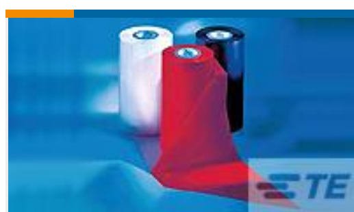
TE Part #143060-000 1330-0600-10