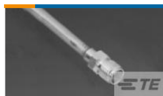
TE Part #1050859-1 2002 5016 00