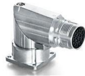
Contact Arrangement mating view

A ED C 047 NN 00 00 051A 000 A G C 047 N 00 00 051A 000