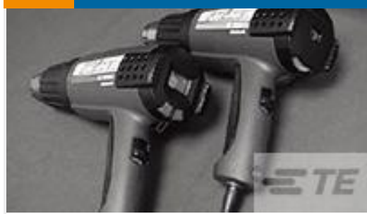
TE Part # CJ2087-000 HL2010E-KIT-120V