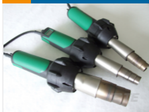
TE Part # EG1114-000 CV1981-ST-230V1600W-EU