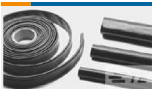
TE Part #CL9350-000 BSTS-17X25FR/NM