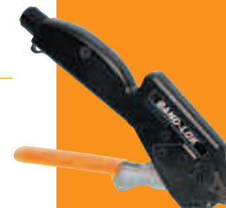
A95079 Band-Lok Tool Adjustable tension, forms lock, cuts off tail.