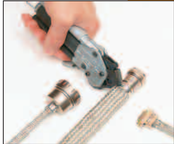
A40199 Tie-Dex II Tool