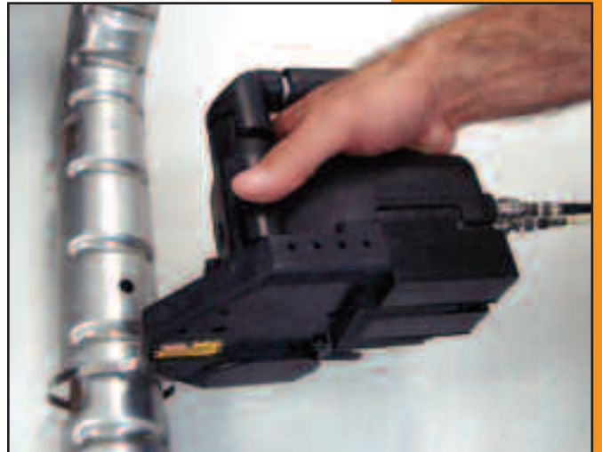
IT Series Tools