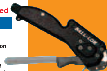
K50289 Ball-Lok™ Adjustable tension, forms lock, cuts off tail.