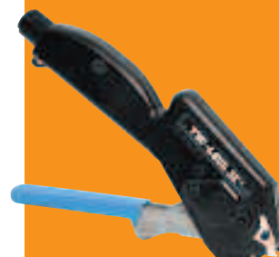
A92079 Tie-Lok II Tool Adjustable tension, forms lock, cuts off tail.