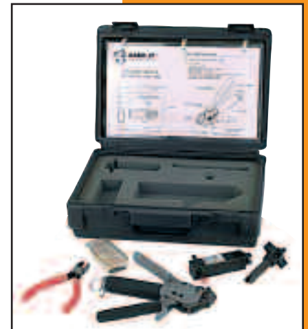
A49099 Tie-Dex® II Kit

Weight: 4.6 Lbs (2.0 Kg). Kit includes: 1-A30199, 1-A47599, 1-A44699, parts and cutters.