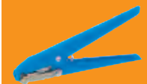
AE2009 Cable Tie Tensioner