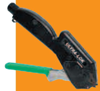
A94079 Ultra-Lok Tool Adjustable tension, forms lock, cuts off tail.