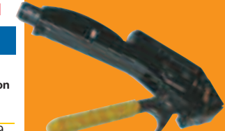
M50389 Multi-Lok Hand Tool Adjustable tension, forms lock, cuts off tail.