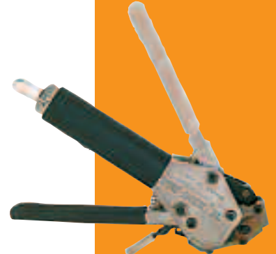
A40199 Tie-Dex® II Tool

Precalibrated tool applies Tie-Dex Micro Bands. Weight: 1.3 Lbs (0.6 Kg). Use the Calibration Key (A44699) to change calibration.