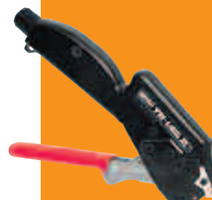
A91079 Mini Tie-Lok II Tool Adjustable tension, forms lock, cuts off tail.