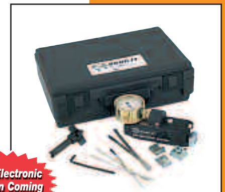
A50099 Tie-Dex® Calibration Kit

50 test bands. Weight: 0.1 Lbs (0.06 Kg).