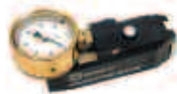
A50189 Tie-Dex® Calibration Device