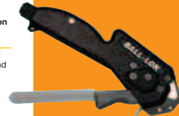
K50289 Ball-Lok Tool Adjustable tension, forms lock, cuts off tail.