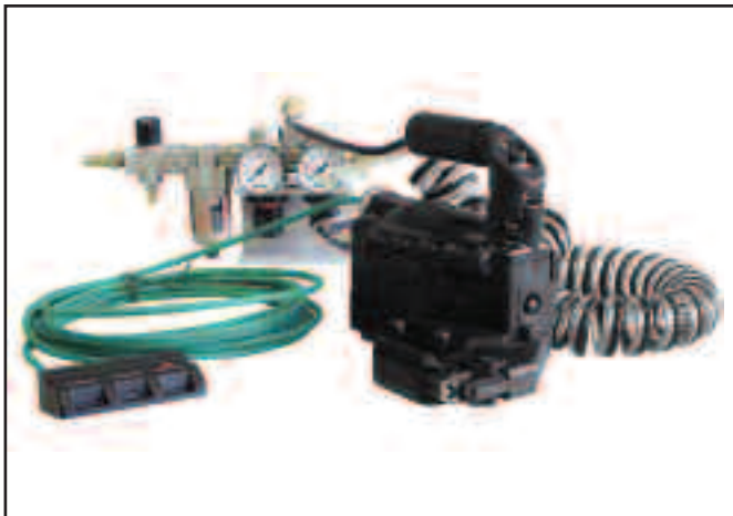
IT Series Tools