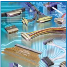
Microdot Connectors and Cables