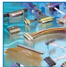
Microdot Connectors and Cables